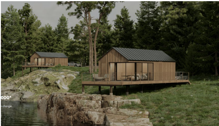
windriverbuilt.com- The Ronan