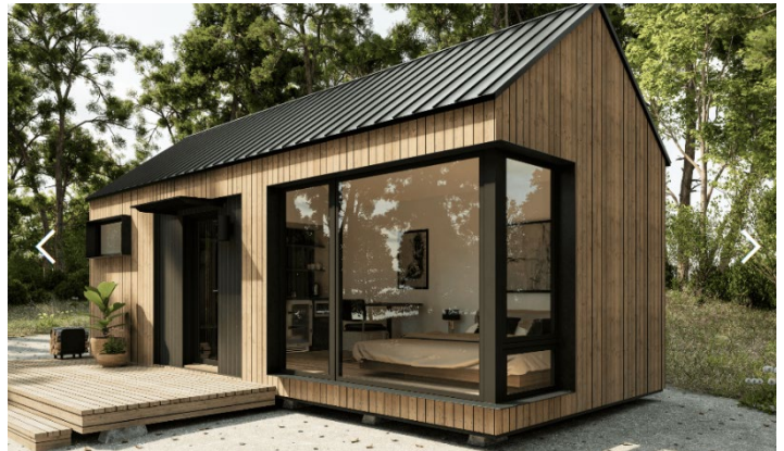
windriverbuilt.com - The Nova