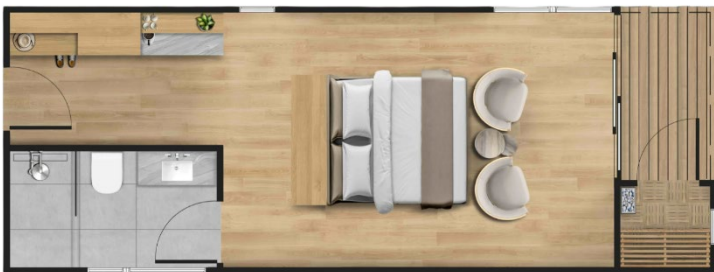
Windriverbuilt.com- The Ronan Floorplan