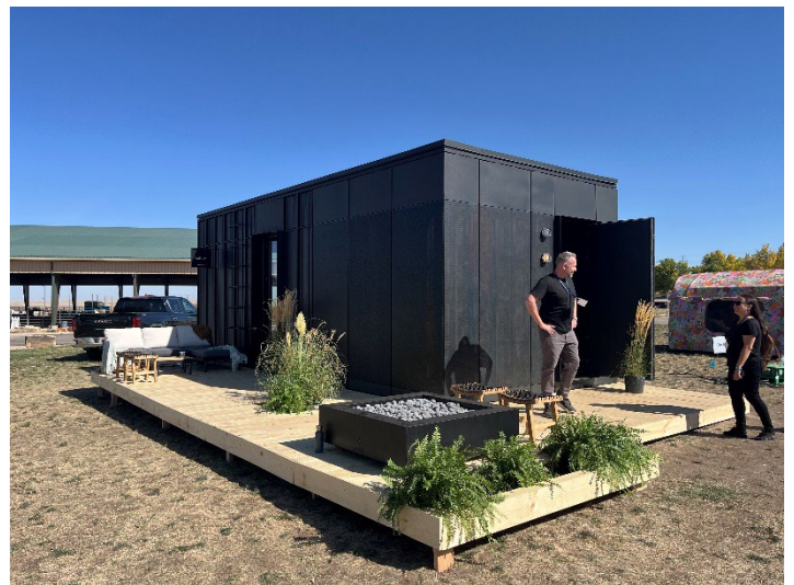
the-nokken.com - NKN-29